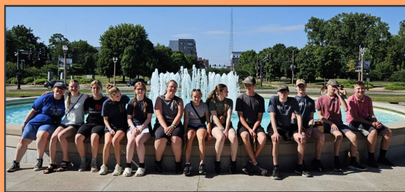
Mission Trip 2024

1 CORINTHIANS 2:9: "As it is written, "What no eye has seen, nor ear heard, nor the human heart conceived, what God has prepared for those who love him, "