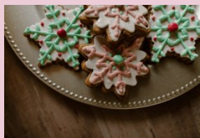
Recently seen around CLC...