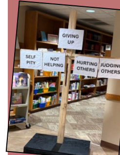
Recently seen around CLC....

We'll pack bags every other Wednesday at 6:00 PM, beginning June 10, at the Community Education Building. Supplies are provided, just come and pack! It takes about 4-5 people and around an hour each week. This is a great opportunity for a small group, family, or friends to serve together. Sign up in the CLC entry.