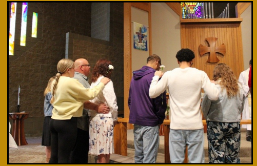
Recently seen around CLC....

Summer can be a challenging time for students who rely on school meals. Our local schools offer a summer backpack program that provides weekly bags of healthy food and snacks for students. CLC volunteers will pack bags every other Wednesday at 6PM, beginning June 10, at the Community Education Building. Supplies are provided, just come and pack! It takes about 4-5 people and around an hour each week. This is a great opportunity for a small group, family, or friends to serve together. Sign up in the CLC entry.